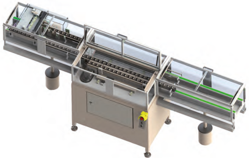
Cleantrak with manual workplace